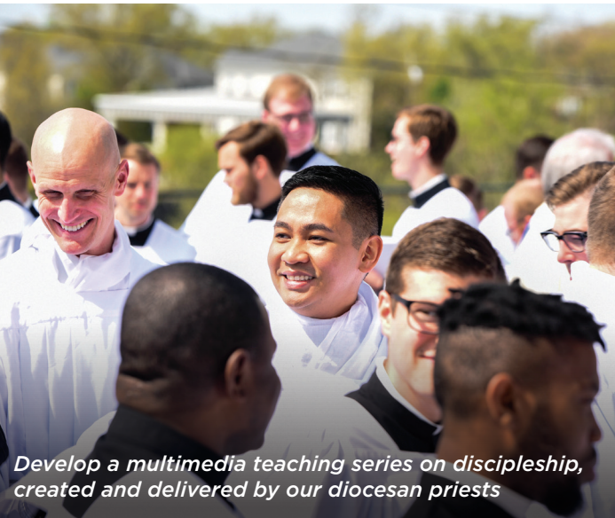
Develop a multimedia teaching series on discipleship, created and delivered by our diocesan priests