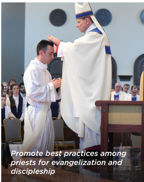
Promote best practices among priests for evangelization and discipleship