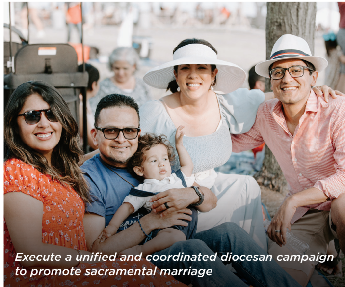
Execute a unified and coordinated diocesan campaign to promote sacramental marriage

To find out more about the diocese's Strategic Plan, scan the QR code or visit our website: www.arlingtondiocese.org/strategic-plan