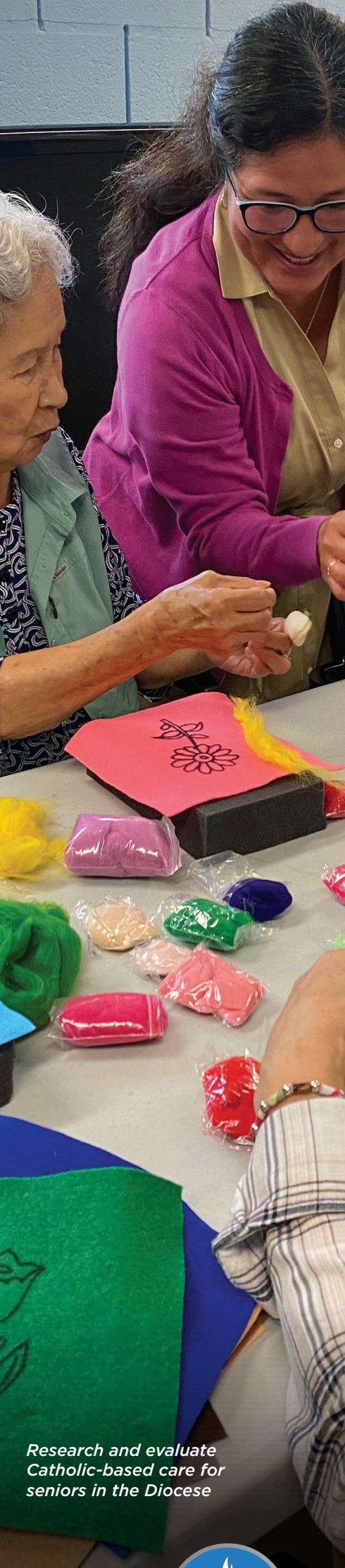
Research and evaluate Catholic-based care for seniors in the Diocese