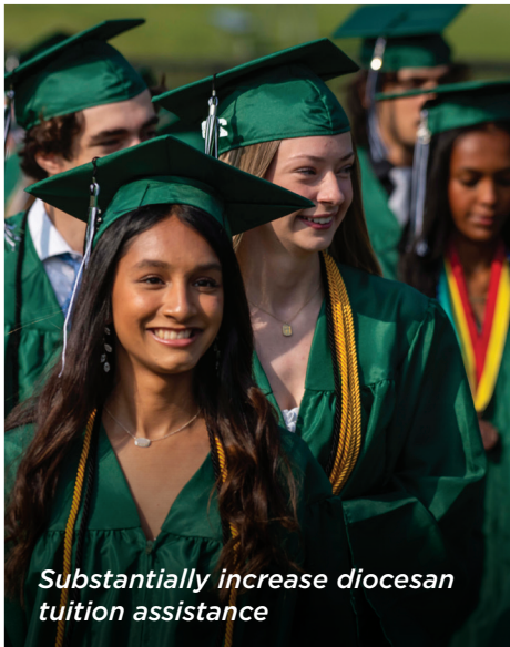
Substantially increase diocesan tuition assistance