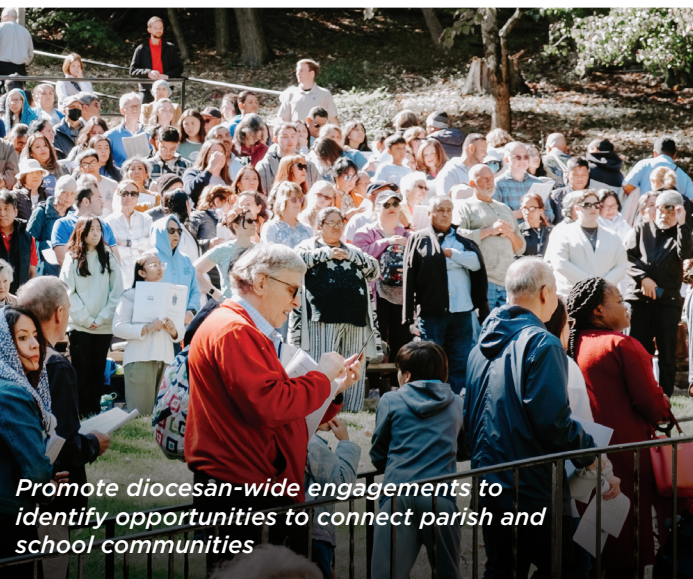
Promote diocesan-wide engagements to identify opportunities to connect parish and school communities

In communion with the universal Church, we strive to be disciples of Jesus Christ by proclaiming the Kingdom of God in both Word and Sacrament throughout our diocese, and by working together in the service of charity and mercy so that all may know the joy of the Gospel.